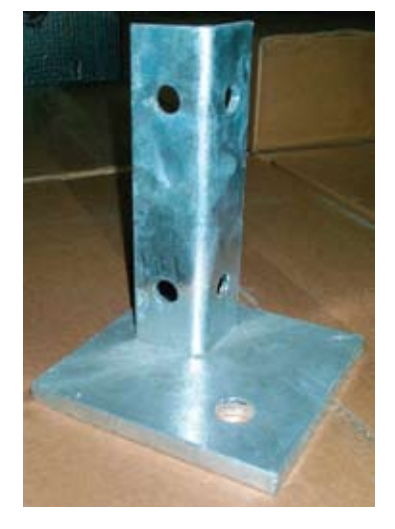
Heavy base plate provided with each tower. Bolts directly to tower legs and provides easy anchoring to plate or foundation.