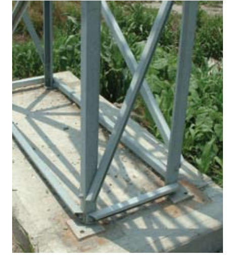
Easy bolt together galvanized steel components for ultimate strength and rigidity. High tensile strength, galvanized bolts and bardware make for a "total maintenance free unit".

Precision Fabricated Galvanized Steel for Fast and Easy Modular Erection Without Welding, Painting or Field Alteration