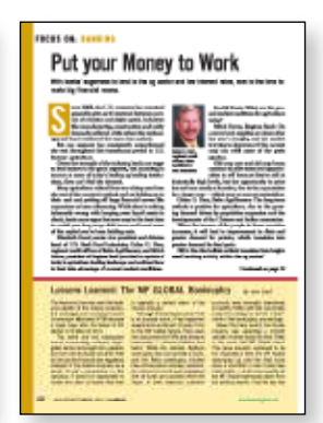
Focus Section Coverage of key issues, happenings and events within specialized sectors of the industry.