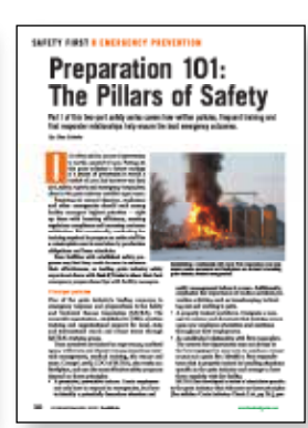
Safety First This feature offers solutions and insight into the most crucial safety issues impacting the industry.