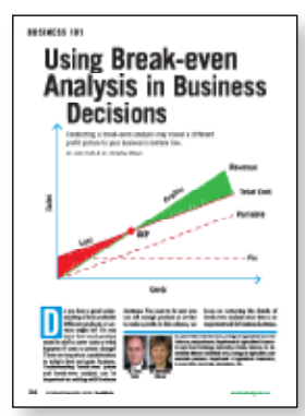
Business 101 With risk management and profitable decision-making tips, these articles keep facilities running smart.