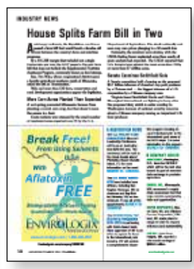
Industry News Highlights changes in the industry and recognizes the accomplishments of the people within it.